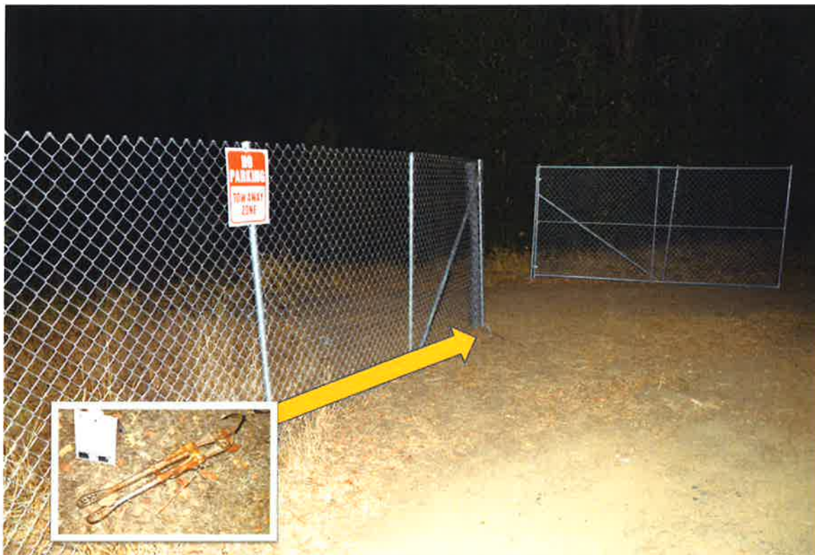
Access gate that Legan opened with bolt cutters

Legan arrived at approximately 6:30 p.m. when the festival vendors were getting ready to close for the day. Legan used the bolt cutters to open the gate, bypassing festival security. Before entering, Legan dropped his backpack, bag, and two rifle magazines on the dirt path a short distance away.