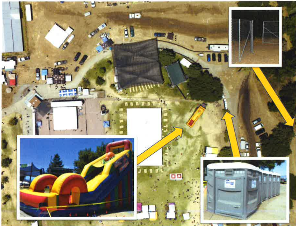
Aerial view of the shooting area with relevant locations inset

Upon entry, Legan walked past a long line of portable toilets and into an open area of the festival near a centrally located inflatable slide being enjoyed by children and adults. The image below shows the relative locations of the inflatable slide, eastern portable toilets and the gate Legan used to enter the park.