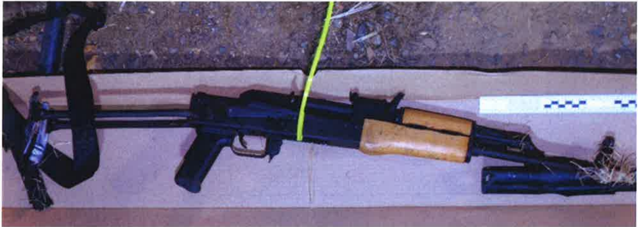
The rifle Legan used to shoot 20 festivalgoers

When he entered the festival, Legan was wearing green and tan colored clothing and a bulletproof vest. He was armed with his AK-47-style assault rifle and had multiple loaded high-capacity magazines, including two that were taped together to allow for faster reload. Legan also had a “drum” style magazine capable of holding 75 rounds of ammunition.