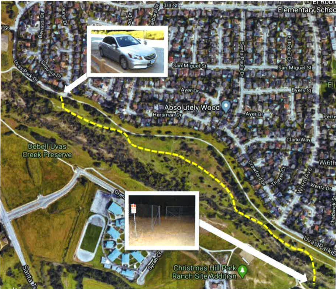
Estimated path Legan traveled to reach the locked festival gate

After parking, Legan descended into the Uvas Creek riverbed carrying an assault rifle and large bolt cutters, as well as a bag and backpack containing multiple loaded magazines of assault rifle ammunition. Following the tree-lined creek just over two miles southeast of his car, Legan crossed over to a dirt path that borders the eastern edge of Christmas Hill Park. The path is separated from the festival grounds by a chain-link fence. He followed the path southeast until he reached a closed fence secured with a zip tie.