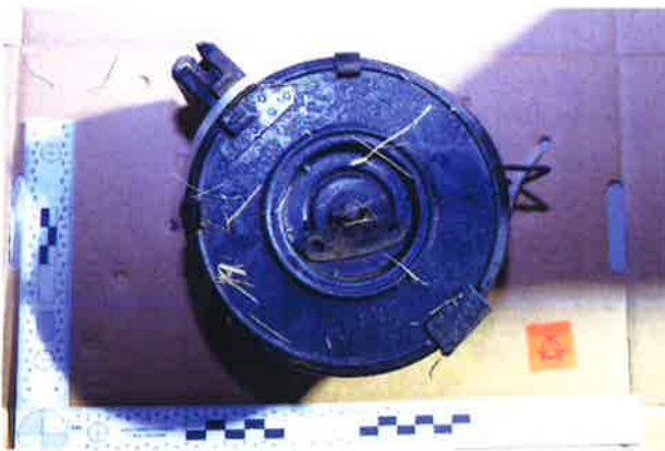
Loaded drum magazine with 75 round capacity