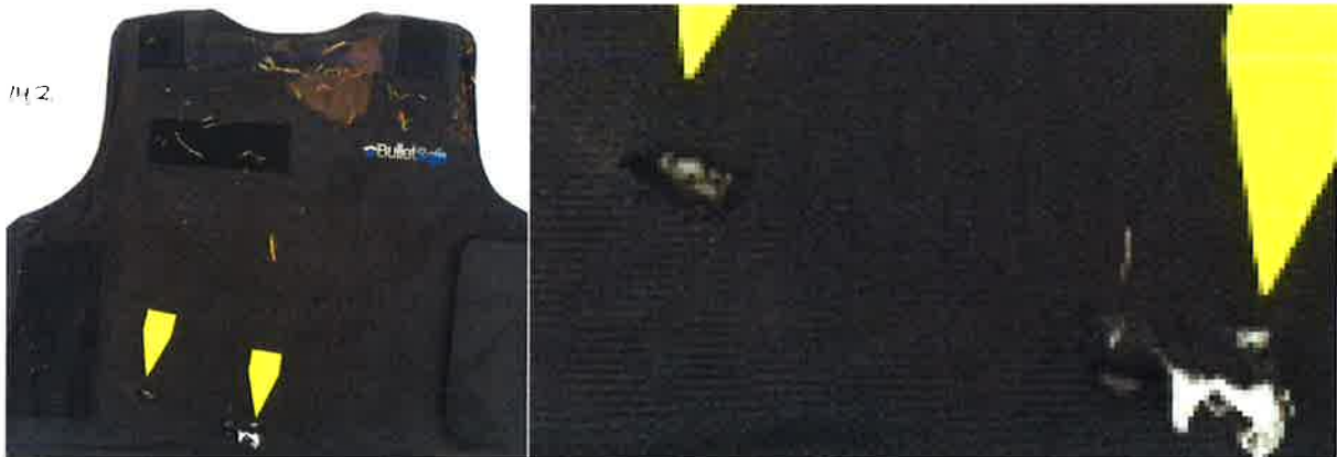
Legan's bulletproof vest, showing two ineffective bullet strikes to the torso

An examination of Legan's bulletproof vest showed that two shots hit him in the abdomen but were ineffective, failing to penetrate it.