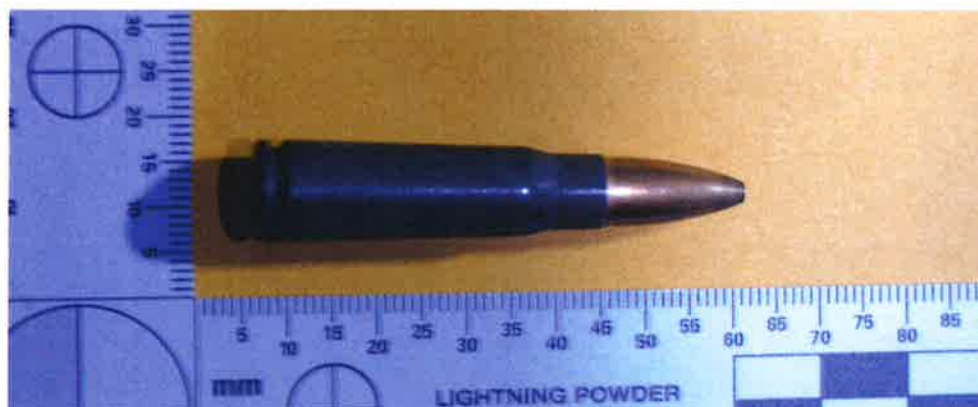
Unfired 7.62x39mm cartridge collected as evidence

attack. Below is an unfired 7.62x39mm round of ammunition collected from the crime scene that measures just over two inches in length: