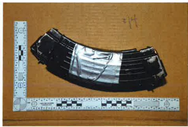
Taped high capacity magazines